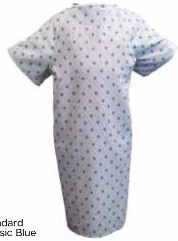
Standard Classic Blue