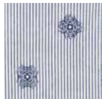
Standard Classic Blue