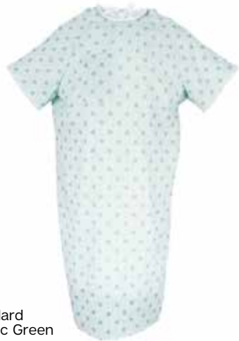
Standard Classic Green