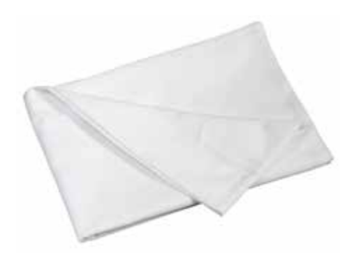
T-180 Sheeting 55% Cotton/45% Polyester