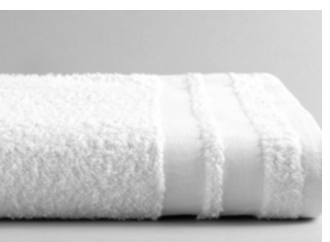
Double Cam Border Terry