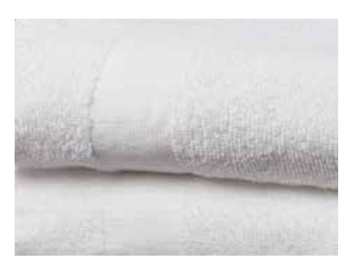
Cam Border Terry

100% Cotton; Washcloth is Hemmed on Four Sides