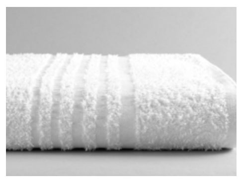
5-Cam Border Terry