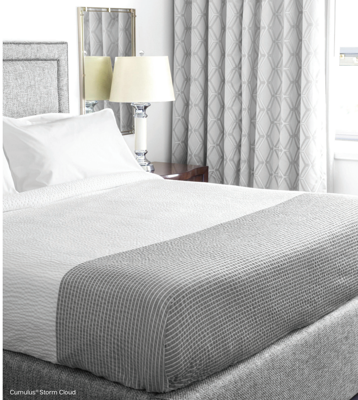
Cumulus® Storm Cloud

To learn more about Standard Textile's Cumulus®, or to contact a dedicated hospitality consultant, please visit standardtextile.com or call 1.800.323.5246.