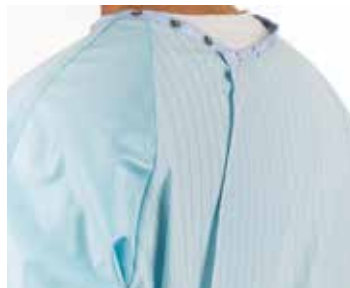
ComPel® MLR Snap Neck