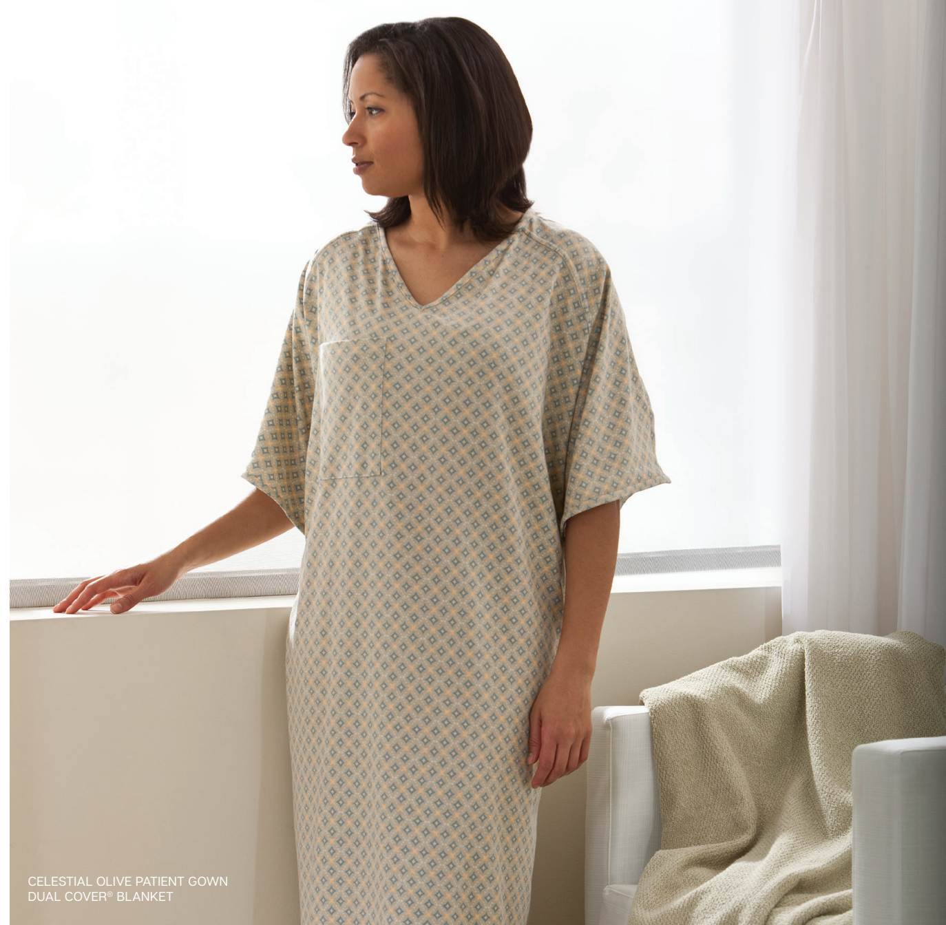
CELESTIAL OLIVE PATIENT GOWN DUAL COVER® BLANKET

Everything works together aesthetically and functionally to create a space that says to the patient, “your experience matters.”