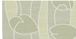
Columbia Serene Green